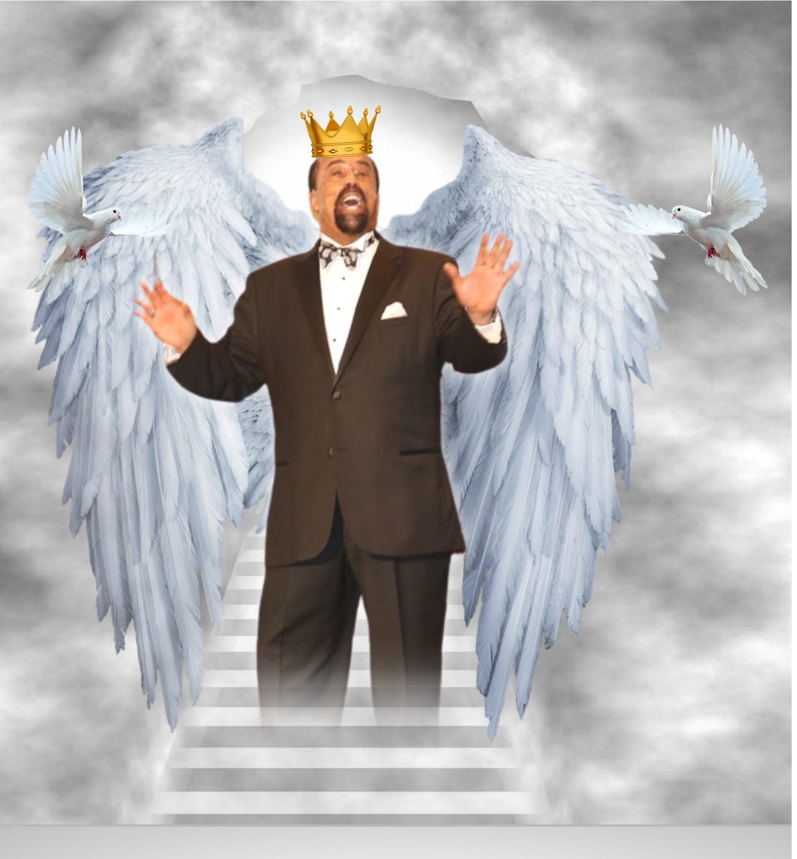
"When I've gone the last mile of the way... I will rest at the close of the day. And I know there are joys that await me... when I've gone the last mile of the way"