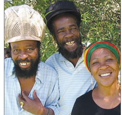
The Itals, roots reggae, from Jamaica and Washington.