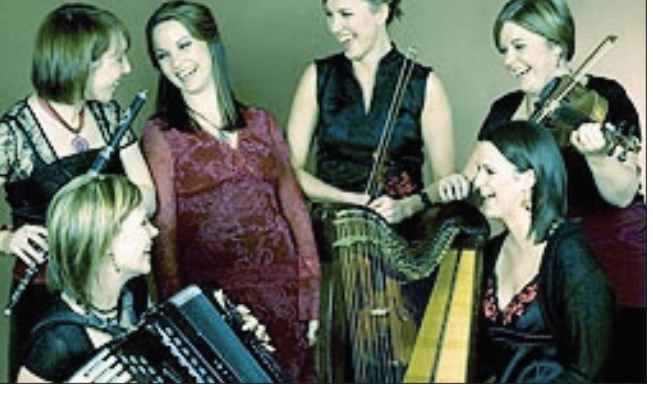
Liadan, Irish music, from Ireland.