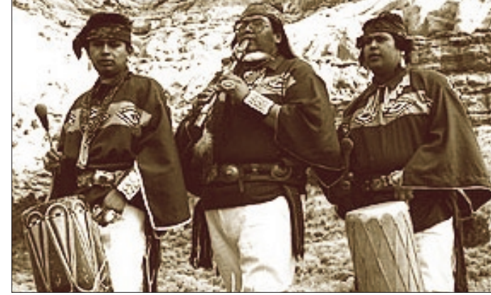
The Cellicion Traditional Zuni Singers from New Mexico

and market quilts, lace, pottery, baskets, wood carvings and other handcrafted items.